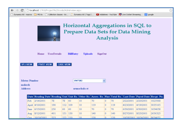
Fig. 4 – Results of SJP aggregation

The prototype is web based application which is built using the environment containing a PC with 4 GB RAM, core 2 dual processor running Windows 7 operating system. The application is built using Microsoft .NET platform. ASP.NET is used for designing application while SQL server is used as backend. For rich user experience AJAX is used. Coding is done using C#. Figure 4 shows SPJ results.