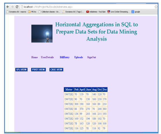
Fig. 5 – Result of Pivoting Aggregation

As seen in fig. 5, PIVOT operation's results are presented in horizontal layout. This kind of data can be used further for data mining operations.